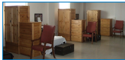
New furniture for the bays.

It may have taken longer than planned to get everything into place, but everyone seems to be very happy with the new furniture.