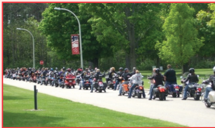
Departing the VA for the start of the 8th Annual FOV Poker Run.